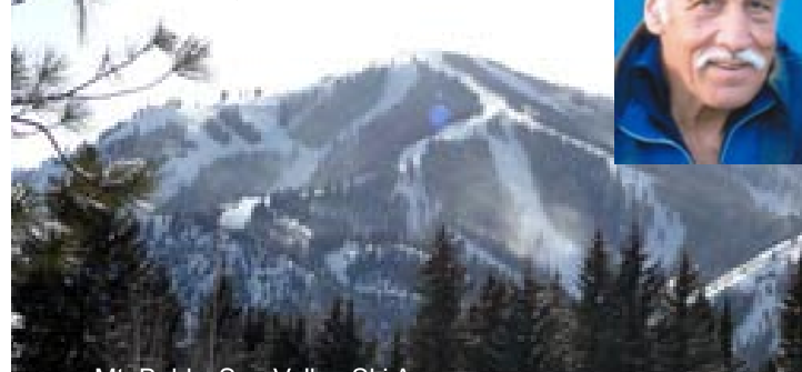
Mt. Baldy, Sun Valley Ski Area