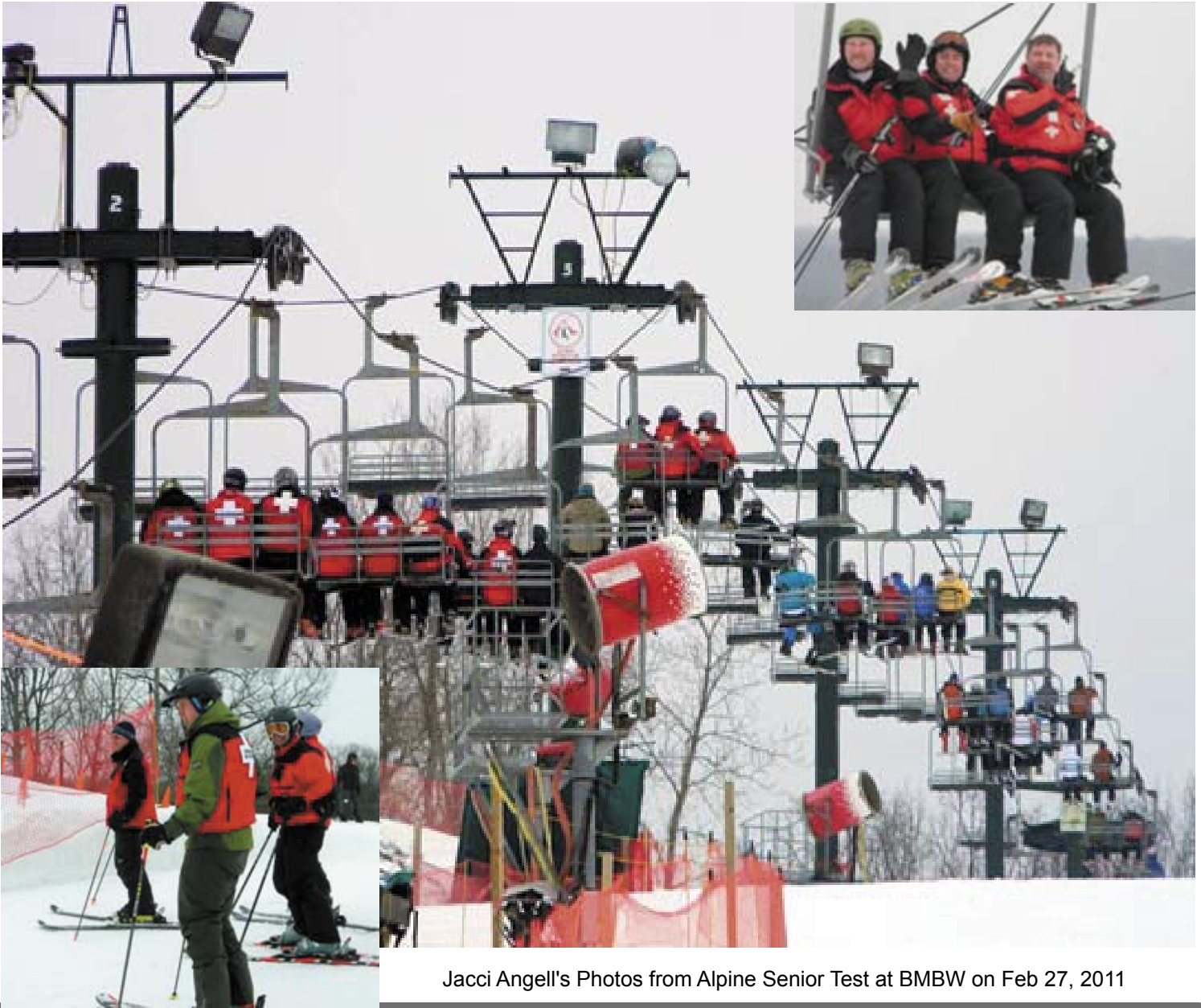
Jacci Angell's Photos from Alpine Senior Test at BMW on Feb 27, 2011