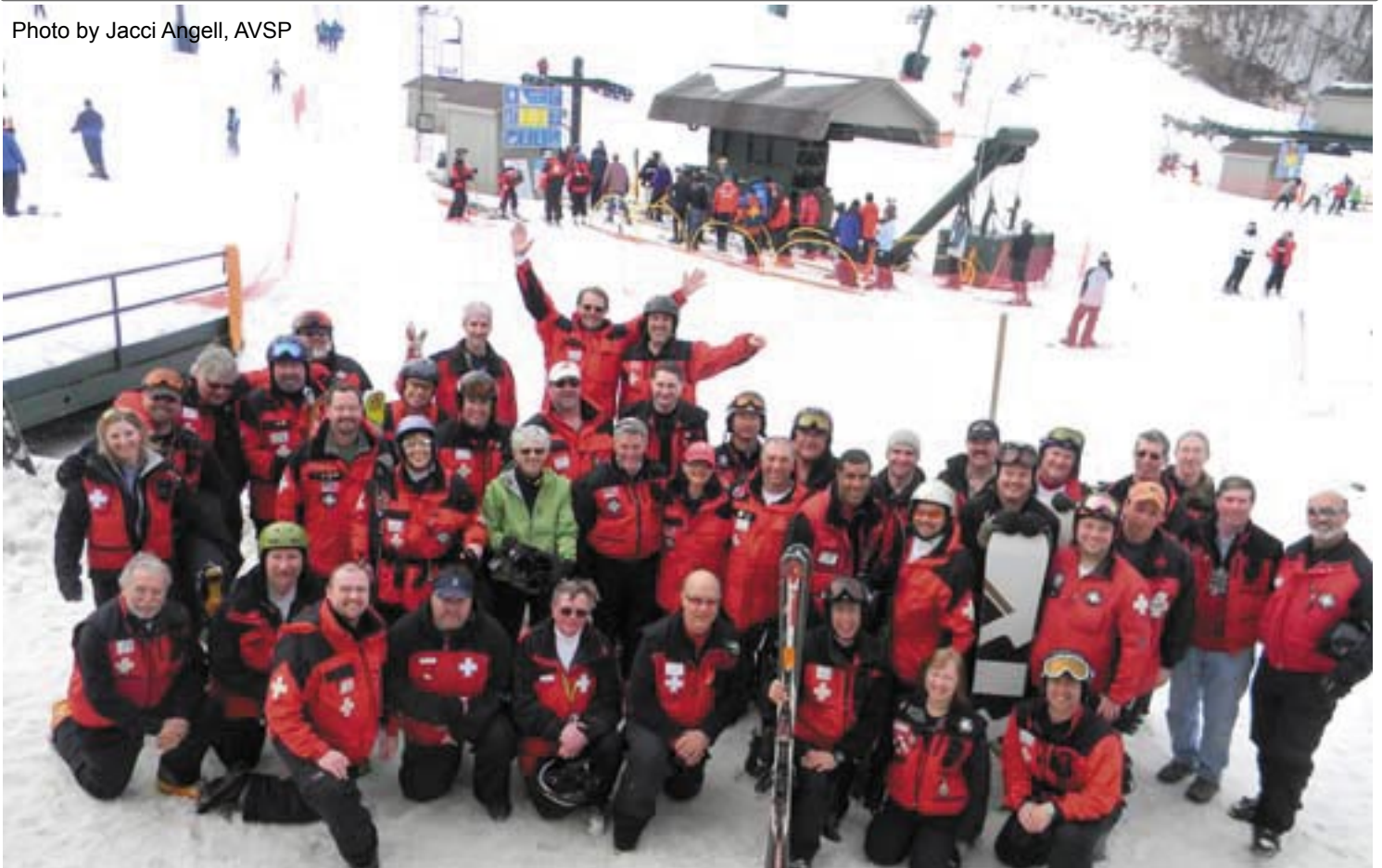
Ohio Region Senior Alpine Ski, Snowboard and Toboggan Candidates, Evaluators and Region Staff at BMBW for Feb 27 Alpine Senior Test,