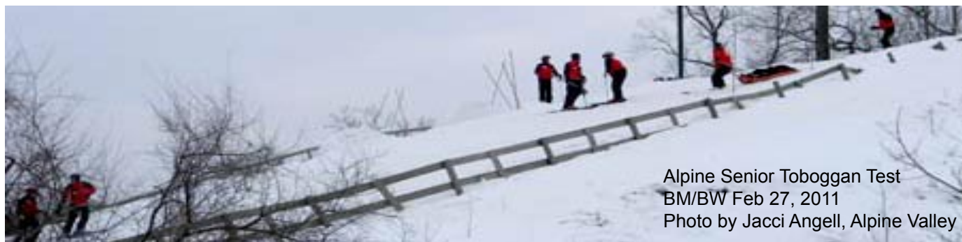
Alpine Senior Toboggan Test BM/BW Feb 27, 2011 Photo by Jacci Angell, Alpine Valley

Legacy Village Shopping Center www.legacy-village.com